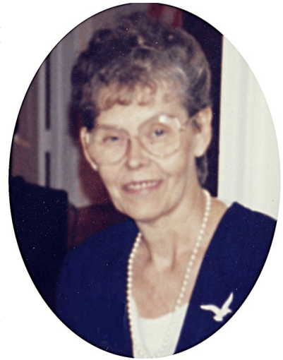
Fig. 3. From a 1996 photo.

While it was a gradual rather than instantaneous enlightenment process, the changes wrought upon my mind-set because of the spirituality-related event and my efforts combined may be likened to going from partial conceptual blindness to comparatively 20-20 I-sight .