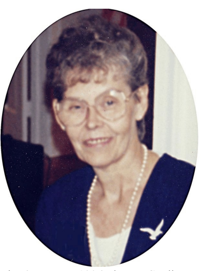
Fig. 3. From a 1996 photo.

While it was a gradual rather than instantaneous enlightenment process, the changes wrought upon my mind-set because of the spirituality-related event and my efforts combined may be likened to going from partial conceptual blindness to comparatively 20-20 I -sight.