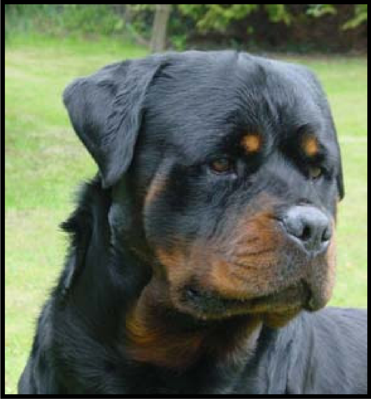
"What exactly is your point?" [The Rottweiler responds to criticism of his contribution]