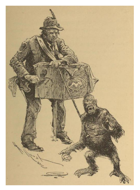
"THE GORILLA WAS A GREAT SUCCESS."

"You see, he reasoned that while it would only be doing justice to the beast to change places with him, it would probably increase the receipts. When a man can do his duty and make money by it his path is middling plain; and after Jewseppy had thought it over he saw that he must do justice to the gorilla without delay.