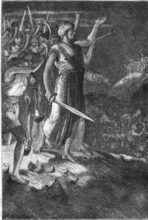
GIDEON'S NIGHT ATTACK ON THE MIDIANITES