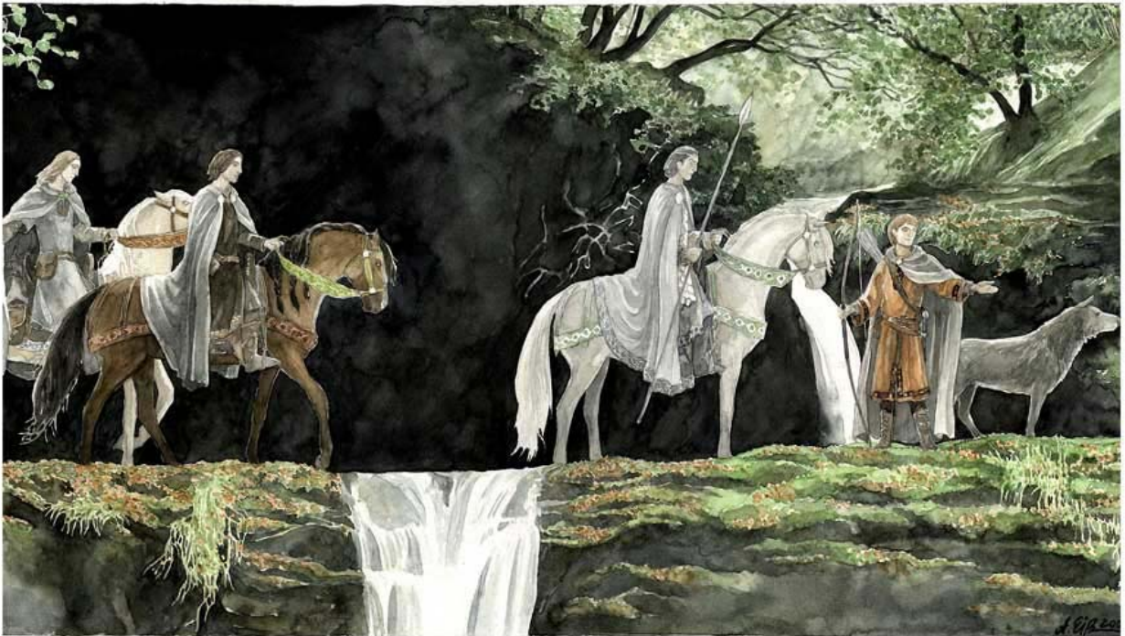
The Hunting Party I