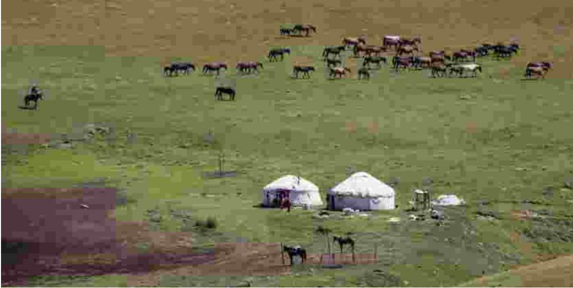
A nomadic camp in the Caucasus.