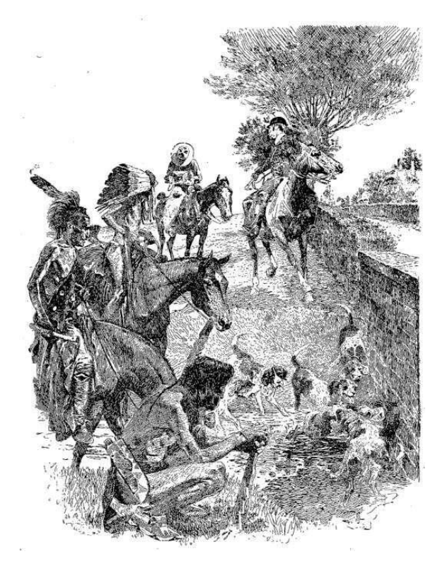
"A little more in the middle"

Lord Ploversdale hesitated. He was speechless with surprise for the moment.