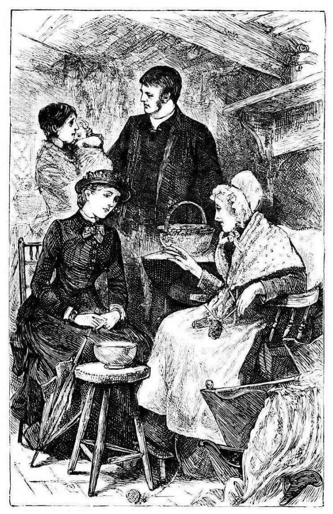
"BY-AND-BY IT CAME TO PASS THAT THESE TWO MET... IN THE COTTAGES"