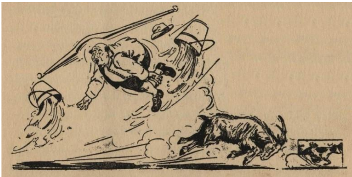
The two pails came down with a thud and a swish

"A thousand lightnings yet again!" yelled Hans as he went over. The two pails came down with a thud and a swish, and goat's milk ran all over the road and down the gulleys at the side. Hans Zug's dog, which had been sniffing at the roadside to see if he could find the trail of a rabbit, now jumped out and came at Billy. With one jerk of his strong little neck the runaway goat picked the dog up on his horns and tossed him clear over his head, where he landed plump on top of fat Hans and knocked the breath out of him for a second time, just as Hans was getting up. Then Billy, feeling fine from this nice bit of exercise, kicked up his heels and galloped on.