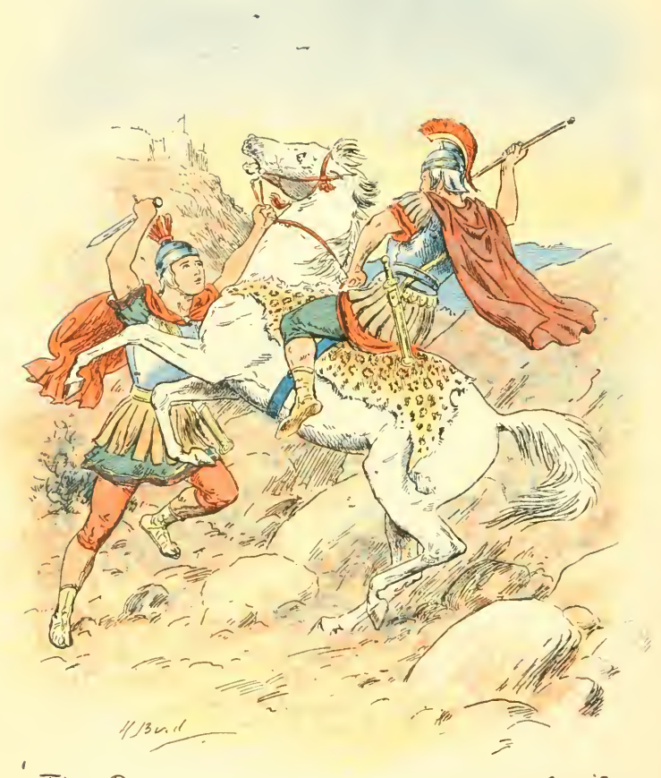
The Brison wasching his opportunity seized the bit in his powerful grasp.