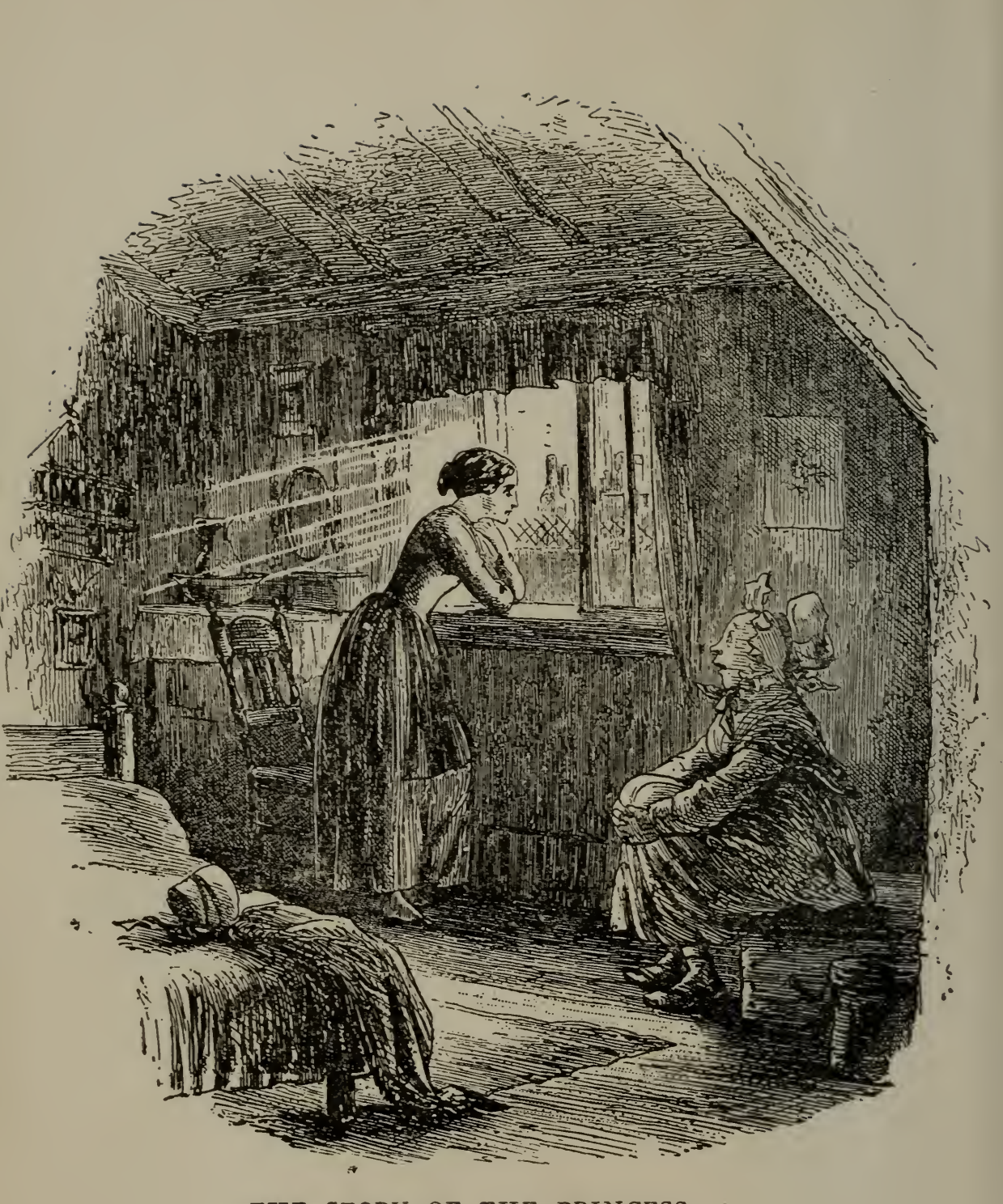
THE STORY OF THE PRINCESS