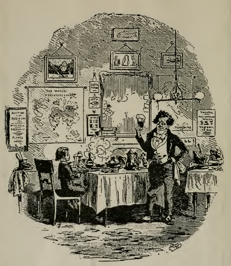
THE FRIENDLY WAITER AND I