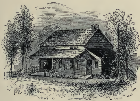
POE'S COTTAGE AT FORDHAM

NEW YORK A. C. ARMSTRONG & SON 714 BROADWAY