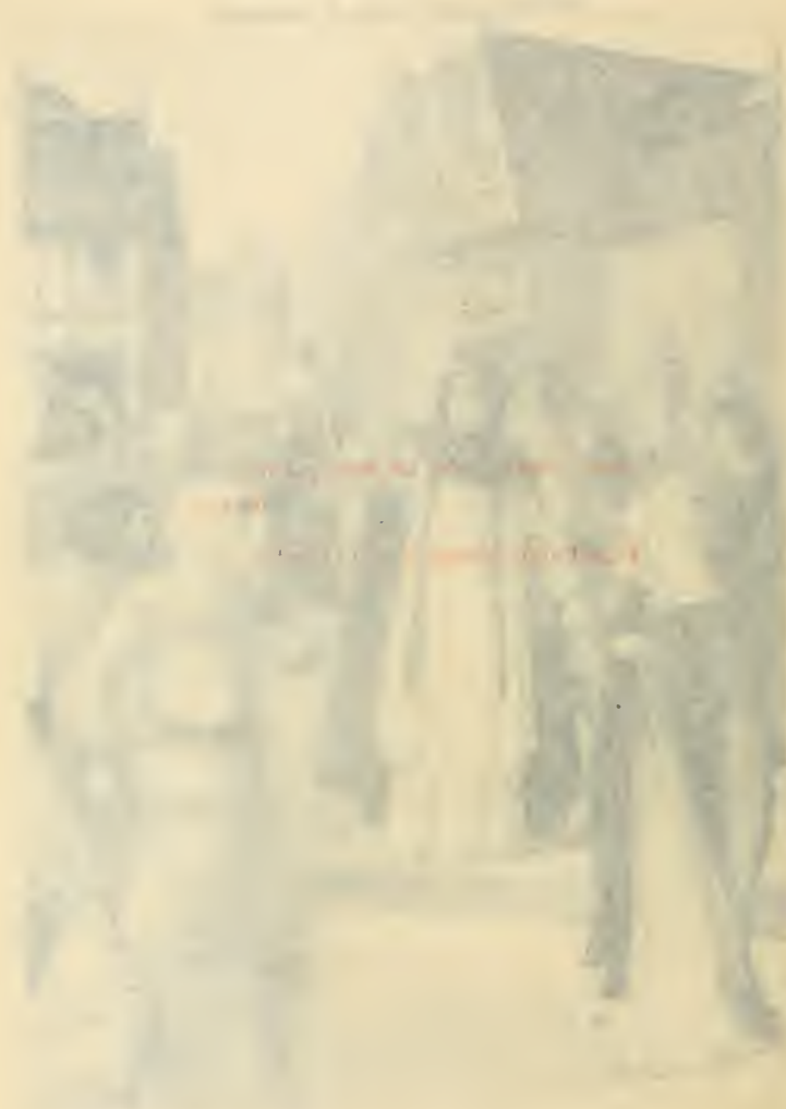
Illustration of a woman in a long dress standing in a public square, surrounded by other figures, possibly a scene from a historical or literary work.