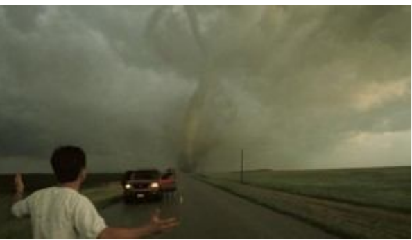
A man watching a nearby tornado