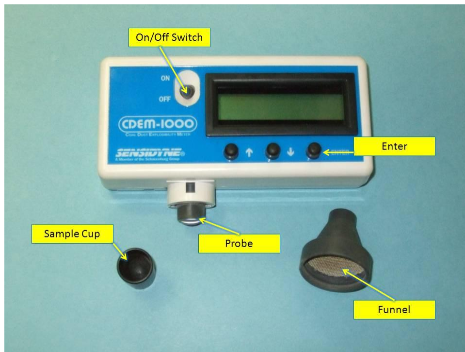
Figure 2. Coal Dust Explosibility Meter (CDEM).

When the CDEM probe is inserted in the dust mixture, the near-infrared radiation reflects off the surface of the dust and back to a silicon photodiode sensor. The normalized reflectance, \Phi , is related to the rock dust to coal dust particle density ratio and the ratio of the mean particle diameters of coal to rock dust contained in the mixture. The normalized reflectance for the tested sample is compared to that of the calibration sample. If the test sample normalized reflectance is greater than that of the calibration sample, it is determined to be nonexplosible. If it is less than the calibration sample normalized reflectance, it is classified as explosible. For further detail on the CDEM design, calibration, and operation, see Appendices A, B, and C.