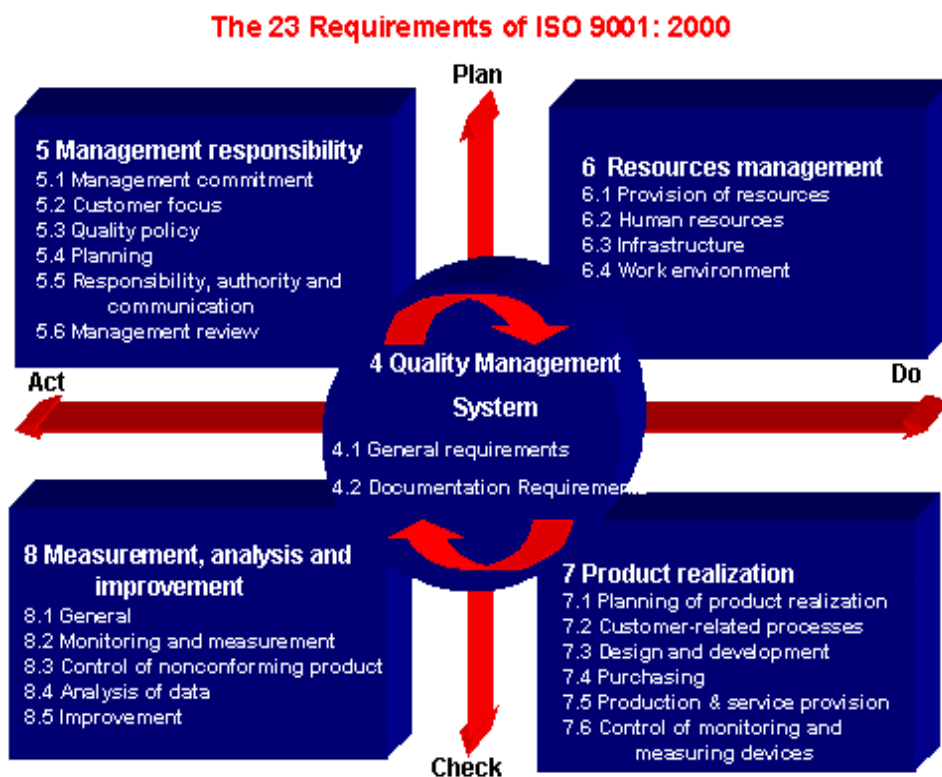
Fig. 5. Requirements of ISO 9001/2000

It should be noted that under the principle of managing processes in the world have been many working tools in various areas of human development, so much so that several of the ISO standards that emerged later, are also developed in the environment processes.