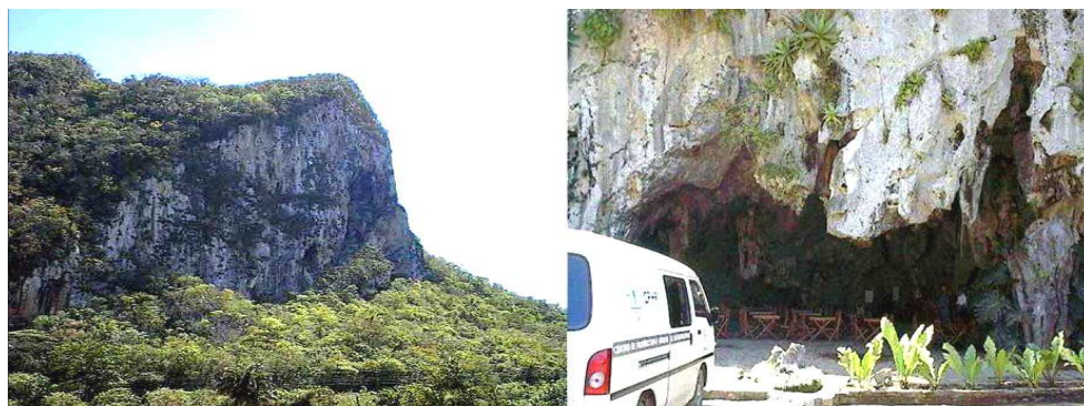
Fig. 1. Karst formations, wooded hills of the Viñales Valey Pinar del Rio, Cuba.

Slow or cumulative events are those that act over a long period of time, so that its effects are evident by inspection. The assignment to the environment and society of these events occurs through the accumulation, in addition, tens of thousands years. For example, karst processes, where cavitations occurs and subterranean (popularly known as "caves"), changes in the relief surface (hummocks, among other forms) (Figure 1), or the presence of small concentrations of substances harmful in rocks, soils and natural waters, which were not detected by specific studies, and they can concentrate to unhealthy levels due to the consumption of water and plant to be drawn from these media.