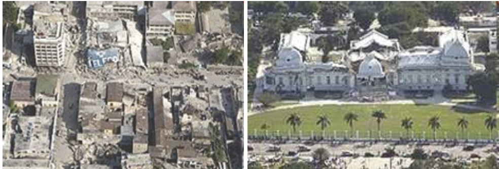
Fig. 2. Sudden geological event. Earthquake Haiti, registered on January 12, 2010 at 16:53:09 local time (21:53:09 UTC) with epicenter at 15 km from Port au Prince, Haiti's capital. Views of National Palace and collapsed buildings in downtown Port au Prince.

the topography and buildings affect the coast, or over the rivers. By contrast, sudden event, usually catastrophic, are those that occur by the release in a short space of time, some energy inside the Earth and its combination with external phenomena, resulting in volcanoes, earthquakes (Figure 2), landslides, mudslides, floods, etc. (Iturralde-Vinent, et al, 2006).