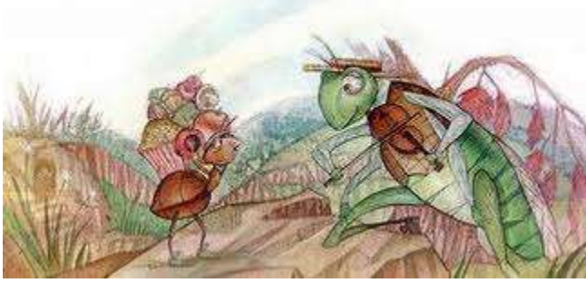
Google Images - The Ant and the Grasshopper