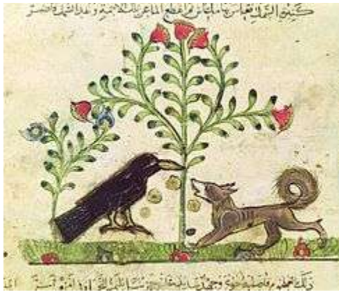
The Crow and the Fox - Iraninan

AE AesopFables.com – Fables of Jean de la Fontaine