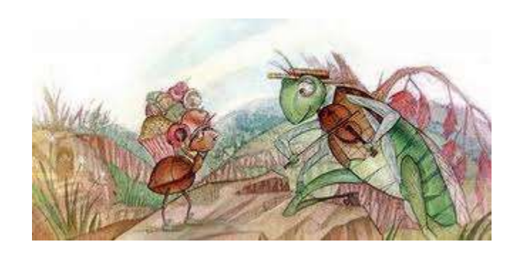
The Ant and the Grasshopper