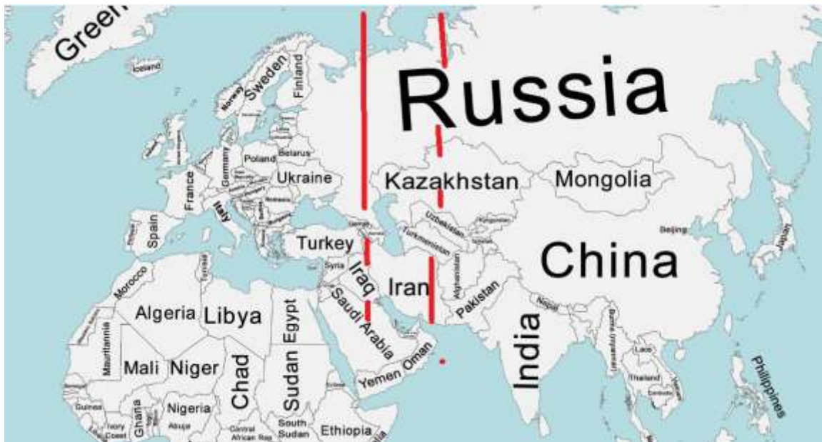
Map 1 The Axis of Oil and Natural Gas

It is always easier for socialist and Islamist dictators to rise to power in countries that are rich in resources. They simply have to promise everything to everyone and people will like them and they will give them power. It is the same story in Saudi Arabia, Iran, the Soviet Union etc. See Wikipedia “Resource Curse”.