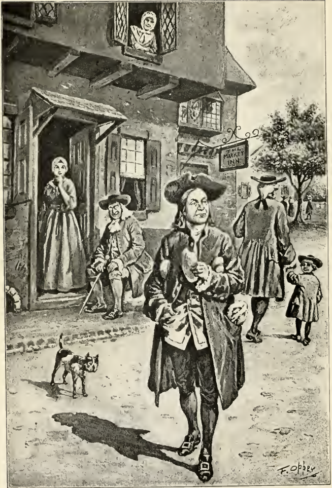
BENJAMIN FRANKLIN ENTERING PHILADELPHIA