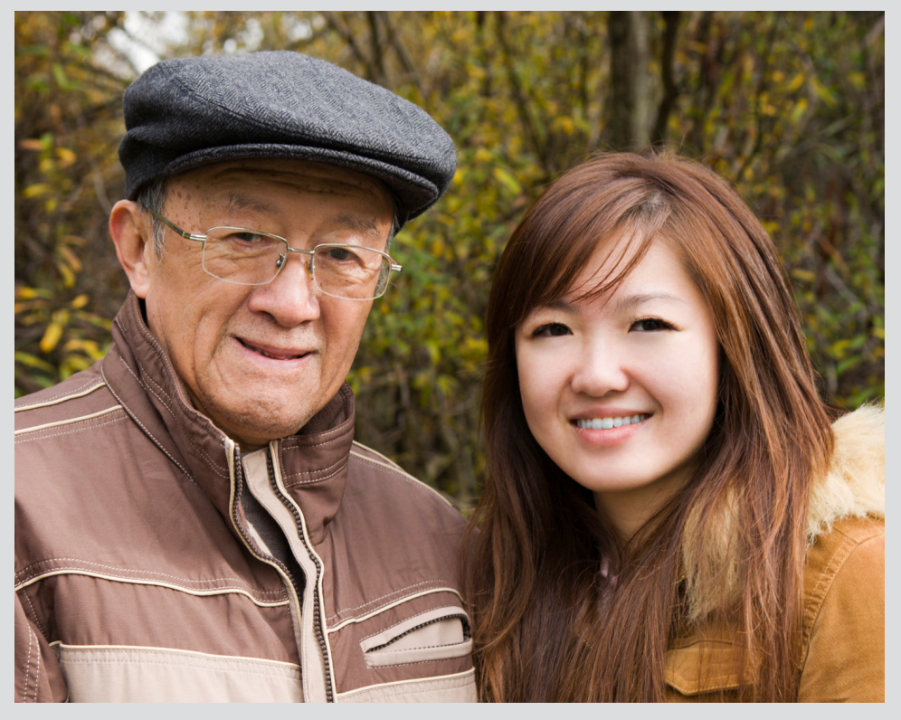
Many older adults and their families are faced with Alzheimer's disease. It's important to know the signs of the disease and where to get help.