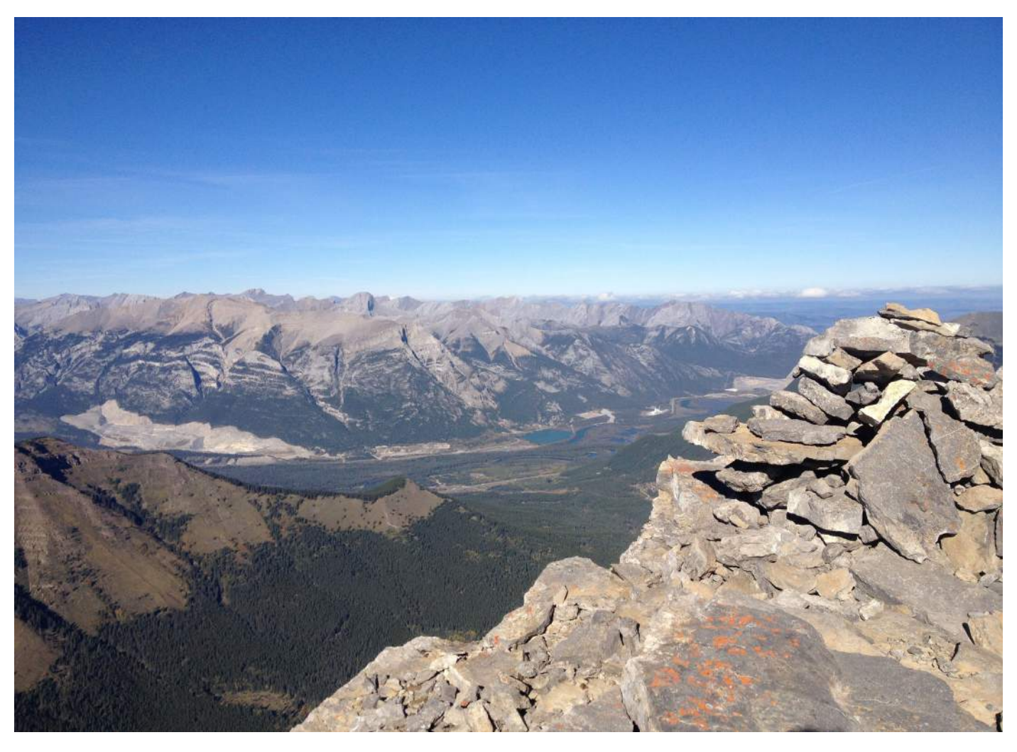
SPRAY LAKES, CLOSE BY CANMORE, ALBERTA: