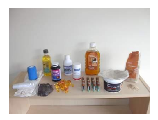
Part 1.2 Materials used:

Now the harmful energy by-products from burning the dead material of fossil fuels has been drawn out it's time for the body to absorb beneficial, life supporting energy which comes from, oil, batteries and vitamins and minerals,