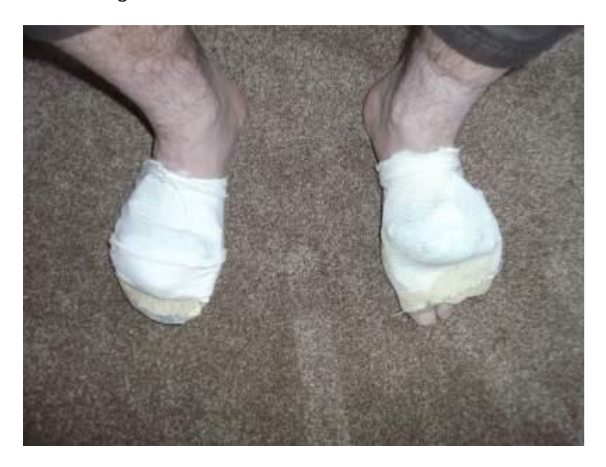
Resting the insteps on the bags: