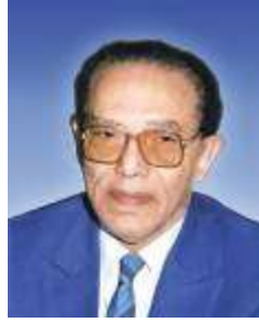
2-Dr. Mustafa Mahmoud

In the introduction to my book A Traveler in Al'lah's World , I previously mentioned that religion has an essential reality which can be described as the ancient love that we bore with us into this world. I referred to the permanent longing that fills our hearts, a longing for the original home from which we came, and to the spiritual thirst that overwhelms our feelings with eagerness for the spring from which we stem. This craving is veiled and concealed from us by the misfortunes, concerns and desires of this worldly life.