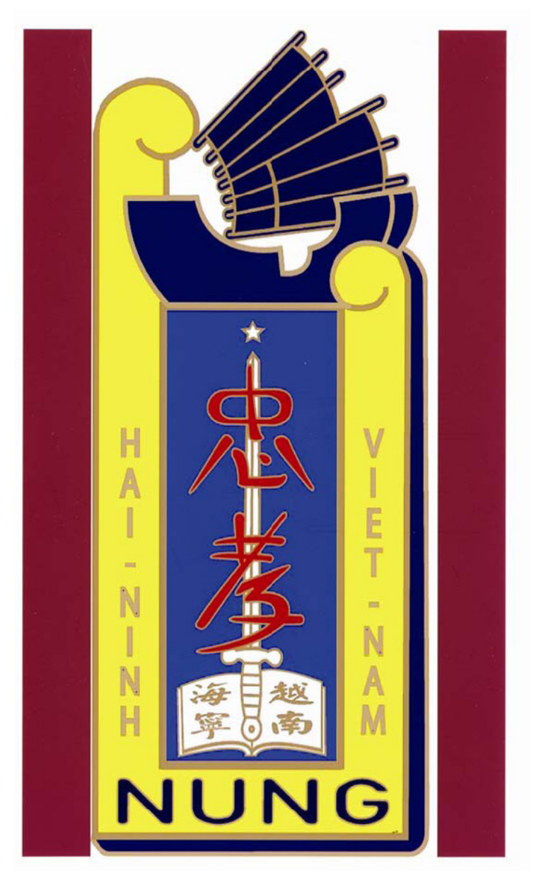
Insignia of the Hai Ninh Veterans and Public Administration Alumni Association