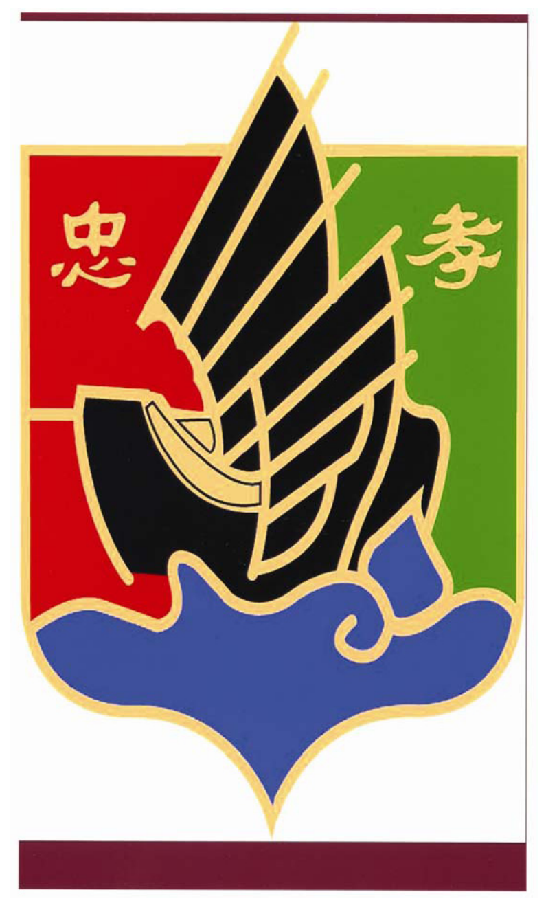
Insignia of the Nung Hai Ninh Autonomous Territory.