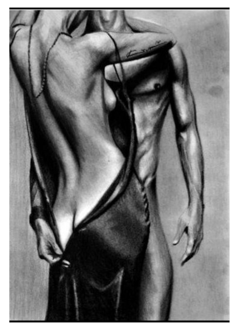
WHAT IT TAKES TO ACHIEVE REAL SEDUCTION

Want more from this author ? Visit <u>http://www.dwpebook.com</u> and purchase Date with Purpose today Go to Facebook and visit Krums Art - <u>http://www.facebook.com/pages/KrumsArt/110729942319364</u>