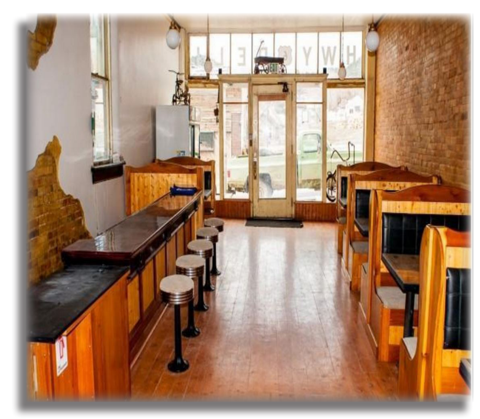
Photo of old Hwy 6 Deli located at 321 Main Street Eureka, UT 84628