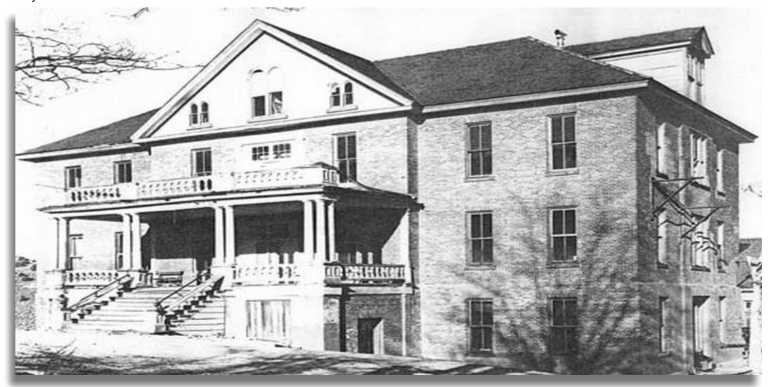
An original photo of the St. Mary Louise Hospital