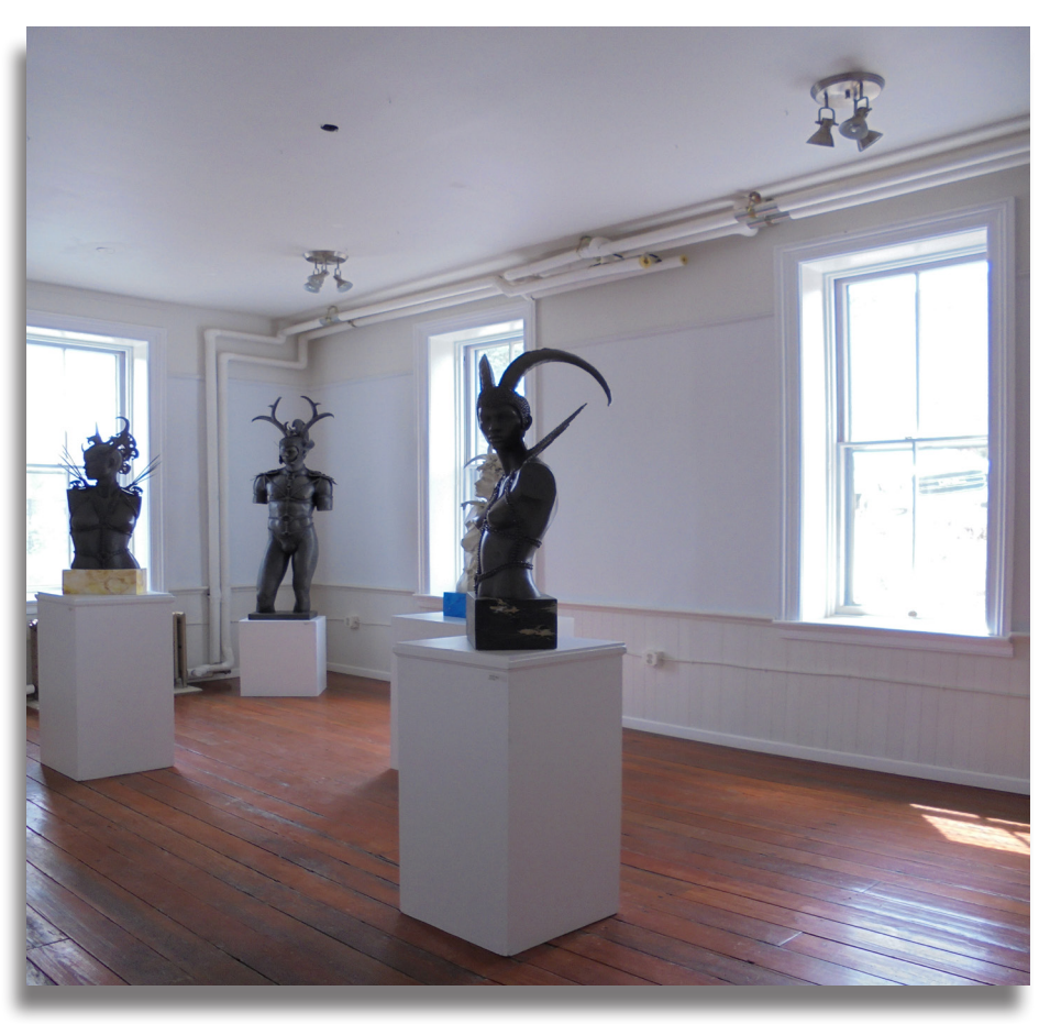
Modern art in a historic building

I promised Jaedene and Jill I'd be back to speak with them before I left and made my way down the hallway. Although the first room I entered to my right was filled with modern art sculptures, the feeling of the environment was not modern at all. As with many old buildings, it also seemed to retain an energy that was filled with many different memories and emotions.