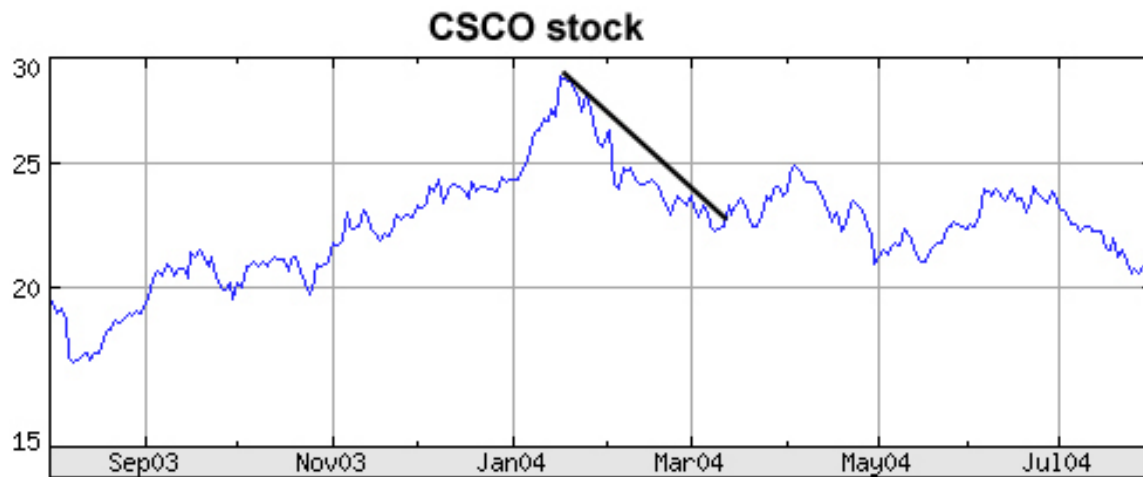
Figure 1.2: CSCO share price

An investor is bearish the CSCO stock (Figure 1.2) and expects this stock to go down in Mar 04. On 16 Jan 04, CSCO stock price was $29.13. This investor sold 3 contracts and the total money that he/she should deposit in his/her account was $8739. However, he/she only deposited $4369.5 because he/she sold with margin. On 8 Mar 04, CSCO stock price went down to $22.36. He/she bought back 3 contracts and received $2031. The percentage return was 45.5% after subtracted the interest rate 1 %. The detail calculation is as follow: