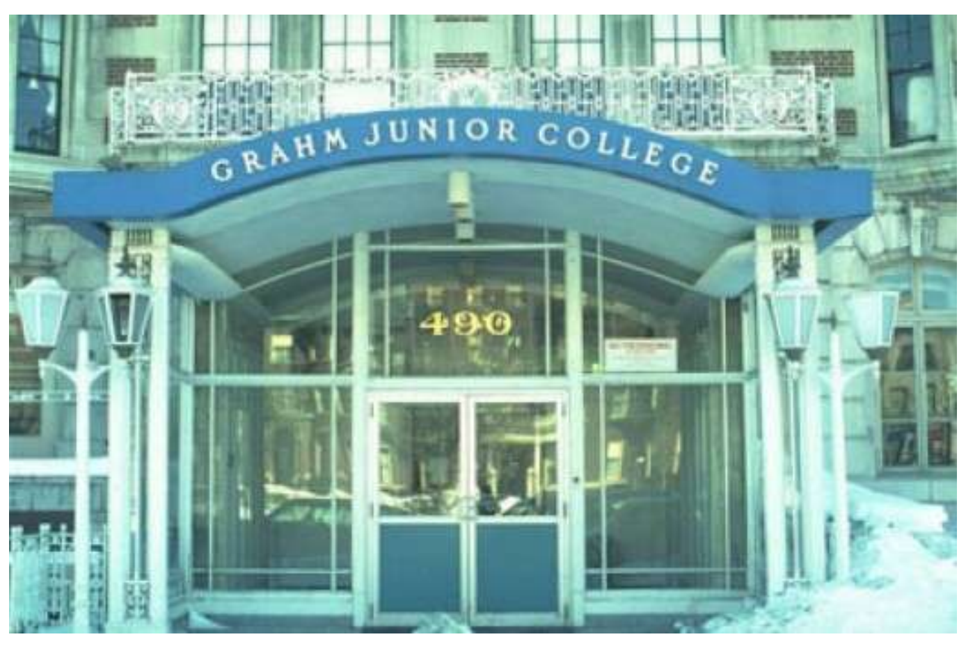
Grahm Junior College - 1960s