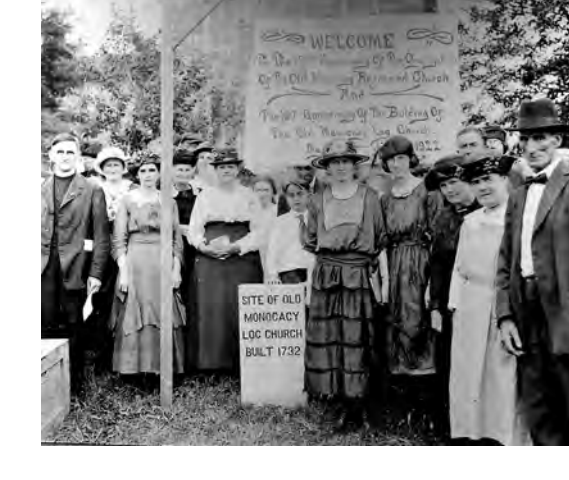
♦ While many of the material remains of this period are gone, many memorial observations of the colonial period have occurred in Frederick County. In this image from 1922, county residents observe the 190th anniversary of the building of the Old Monocacy Log Church and the later organization of the Old Monocacy Reformed Church.

By the early 1720s, European colonists were beginning to enter the region. Most of these colonists were attracted to the rich farmland, which caused tension and conflict with American Indians. Roughly sixty percent of these early settlers were British and the remaining forty percent were largely German, along with some Swiss and Scotch-Irish. The German settlers served as a buffer between British and French territorial claims. These settlers farmed grains, which were milled into flour, and manufactured goods including lime, iron, and glass. The need for a central economic and political site emerged, and Daniel Dulaney, a land speculator and a member of Maryland's colonial government, purchased Tasker's Chance, a large tract of land in the Monocacy Valley where he established Frederick in 1745. Dulaney sold individual lots to settlers. The first purchasers were John Thomas Schley and his wife Margaret from the German Rhine. John Thomas, who had been a schoolmaster in Germany, established a tavern in Frederick. He was also active as a musician in the German Reformed Church. With the church, he served as a schoolmaster