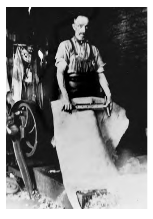
❖ Tanneries employed Frederick County residents from the eighteenth through the twentieth centuries. This image shows an employee of Birely Tannery at work.

By the beginning of the American republic, slavery already had a long history in Maryland. Indentured servants from Europe and Africa were among the first settlers in the Maryland colony in the 1630s. Indentured servants were not strictly slaves—but were individuals who exchanged a set period of labor for transportation to the colonies-and included a range of ethnicities, including both Europeans and Africans. This system bore similarities to slavery and became linked to race-based slavery in Maryland. In 1664 the Maryland colonial government decreed that people of African origin and their children were slaves for life, a decision that was made partly to fill the need for labor in the Eastern Shore's tobacco fields. While African slaves continued to be imported throughout the eighteenth century, the Act Prohibiting Importation of Slaves of 1807 made it illegal to bring new slaves into the United States. However, the United States' massive enslaved population allowed this cruel institution to continue to thrive, particularly in the South. In Frederick County, some early settlers from the