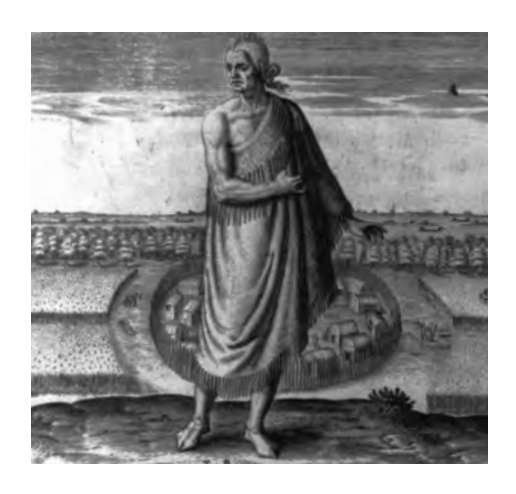
♦ John White's 1590 representation of a man from Pomeiock. He is wearing clothing appropriate for winter in the Carolinas and his community is visible in the background. Social organization and cultures varied widely throughout indigenous North America, but the Pamlico also spoke an Algonquian language and their clothing may have been similar to that worn by the indigenous inhabitants of the Chesapeake region.

Around 1000 CE, maize, a major new resource, began to emerge in the Middle Atlantic region. Although cultivated for thousands of years in Mexico, selective breeding of maize in North America over a long period finally enabled the crop to thrive in the colder northern climate. This led to a greater emphasis on village life, and agricultural production became an important resource that eclipsed hunting and foraging. Many villages were located in floodplains for access to rich soil. An increasing numbers of stockaded villages after 1300 CE hint at a growing tension in the region, possibly due to a global climate shift that left eastern North America wetter and colder. With an