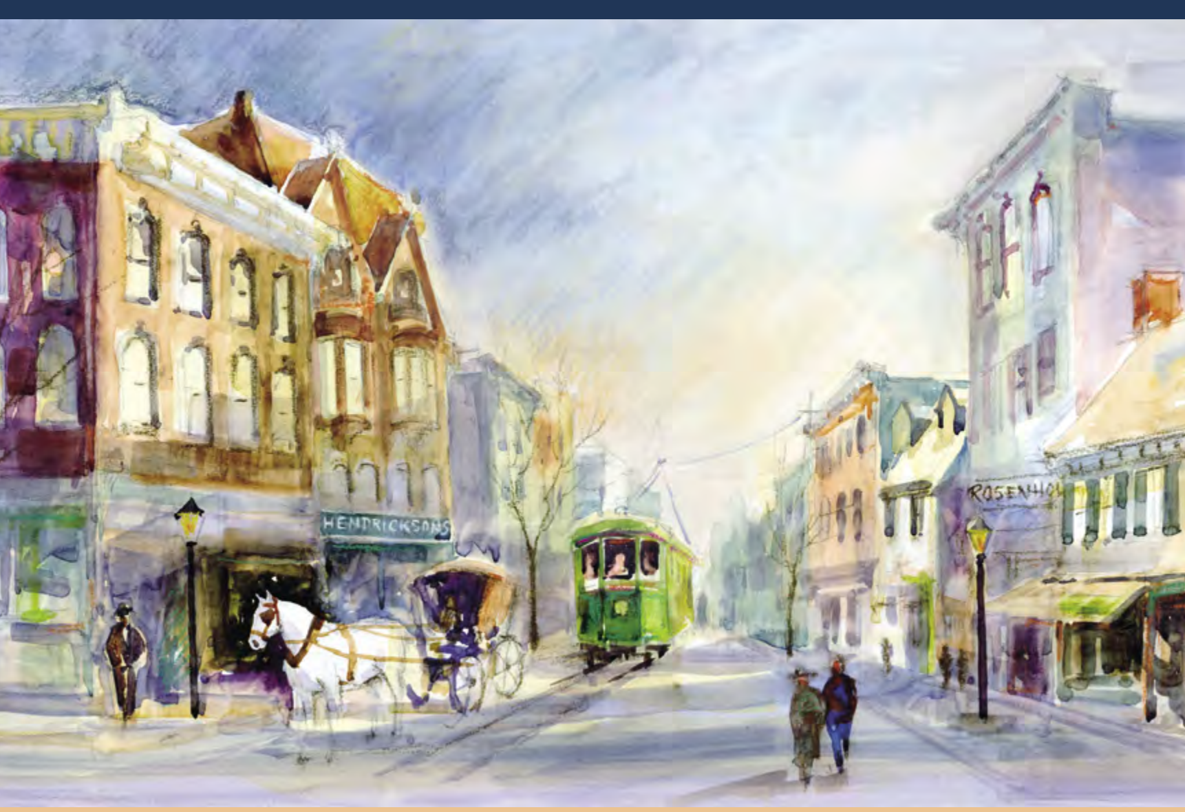
A publication of the Historical Society of Frederick County