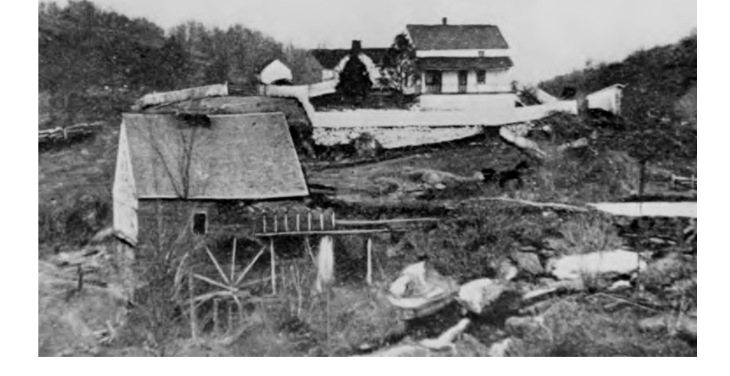
♦ Jeffrey Hurwitz's mill on Easterday Road, c. mid- to late-nineteenth century.

distilleries processed large amounts of alcohol. In 1810 distillers produced over 350 thousand gallons of alcohol from fruits and grains. Welty's South Mountain Distillery likely originated in the 1790s.