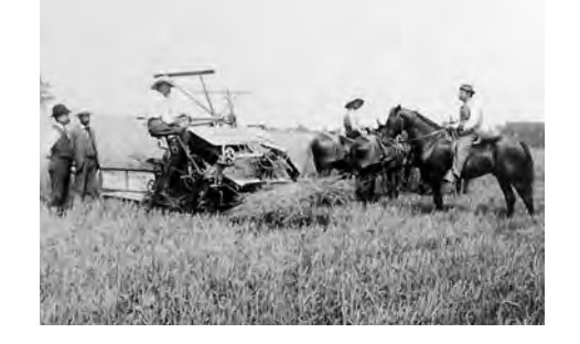
♦ Agricultural production of grains such as wheat and barley remained central to the county's economy throughout the nineteenth century and into the twentieth. In this image, farmers use a horse-drawn grain binder during the harvest.

After American independence, farming continued to dominate Frederick County's economy. Outside Frederick, most county residents were farmers. With a favorable climate and soil, wheat became the county's major agricultural product after Charles Carroll of Carrollton encouraged regional farmers to adopt it late in the colonial period. Other grains, including barley, oats, and rye, were also raised, as were limited quantities of tobacco. Due to the climate and the soil, which was quite different from the Eastern Shore, tobacco remained a volatile product in Frederick County and never became a significant export. With all of this agricultural activity, the Frederick County Agricultural Society was organized in 1821.