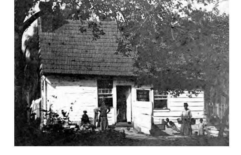
According to local tradition, this cabin on Saint Street in Frederick, which was in disrepair when photographed in the nineteenth century, was briefly used by George Washington as a headquarters during the French and Indian War.