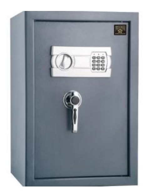
Say "Yes" To Home Security Surveys

If you want to keep your valuables safe, you should invest in a home safe. This will not only keep burglars from getting your precious valuables, but will protect your important paperwork in case of a fire. Be sure to purchase a safe that will be too heavy for the burglar to pick up. An electronic digital safe will nearly be impossible to crack, so this is exactly what you should purchase.