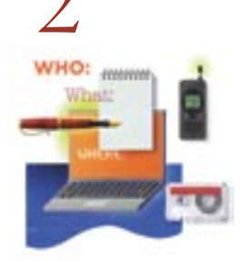
Getting the Story [12]

Types of news Where the news comes from The journalist's role Objectivity and fairness News providers