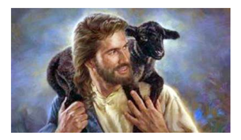
From Jesus with Love

I love you as if you were the only one. My love is reaching out to you right now. My love, My forgiveness, and My mercy are all right there, just for you, if you will only receive them.