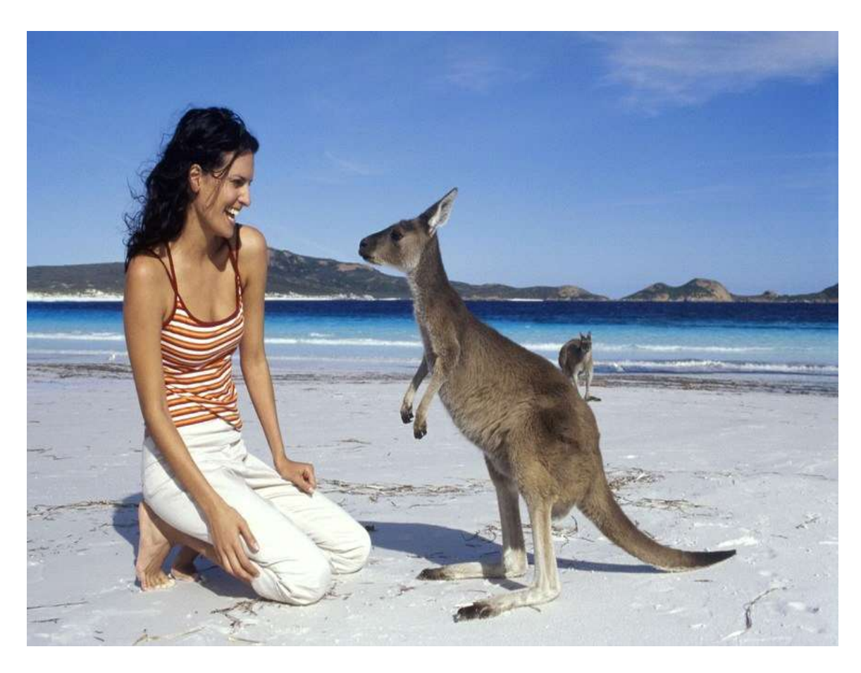
"Australia Has Secretly Become the Hottest Vacation/Holiday Spots to Travel"...