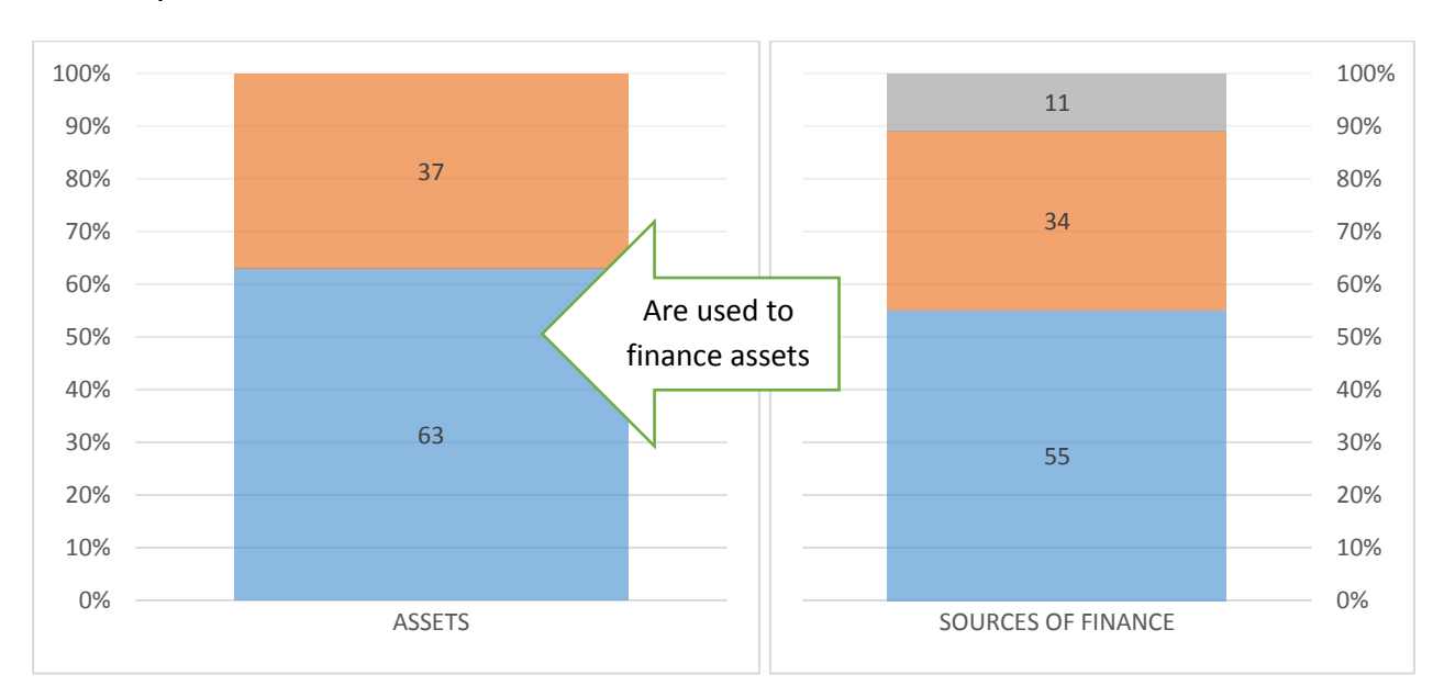
Chart 1. Assets and sources of finance

Typically company's annual report consists of the introduction section, balance sheet, profit and loss report, cash flow statement and notes to the financial statements. Sometimes it also includes some other components, such as chairperson's statement, director's report or auditors' report.