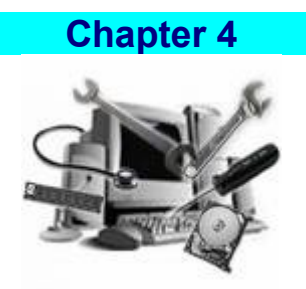
Registry Repair Tools Repairing and maintaining your Windows Registry has never been easier.

Make sure you are highlighting Computer otherwise your search will be confined to the key you have selected. Now click on Edit then Find and type in Microsoft as your search term. You will be directed to the first Microsoft entry in the registry. Press F3 to continue searching. This is a good exercise in learning how to find all entries related to a specific program and deleting them in the most efficient way. So grab your list and start searching away. If you would like a quicker way download my registry repair tool