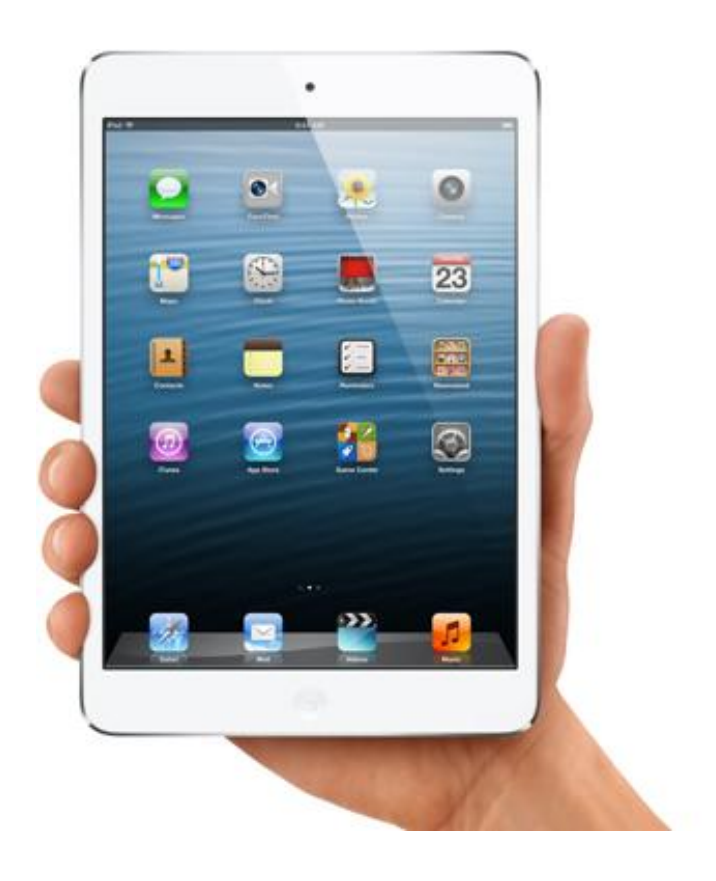
iPad Era Use, work and play with the gadgets of the century

IPads, as it called actually relatively denotes the simplicity of the gadget to the non tech savvy individual. Being a tool to access information which is pleasing to the eye in its design and functionality is the pivotal selling point for iPads.