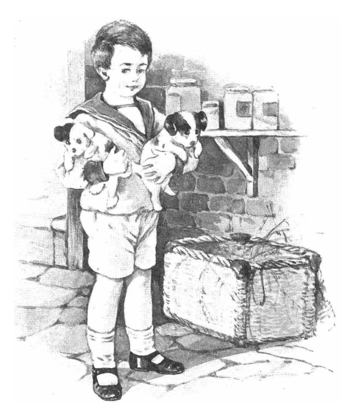
"Oh, Daddy!" was all Jimmy could say.

"What shall we name them?" asked Daddy, after he had laid the doggies on a pretty green cushion by the fireplace. Jimmy turned his blue eyes way up. He was trying to think.