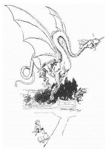
"The dragon flew away across the garden."

The Chancellor and the Prime Minister and the Nurse all came running to see what was the matter. And when they saw the book they understood, and the Chancellor said: "You naughty little King! Put him to bed, Nurse, and let him think over what he's done."