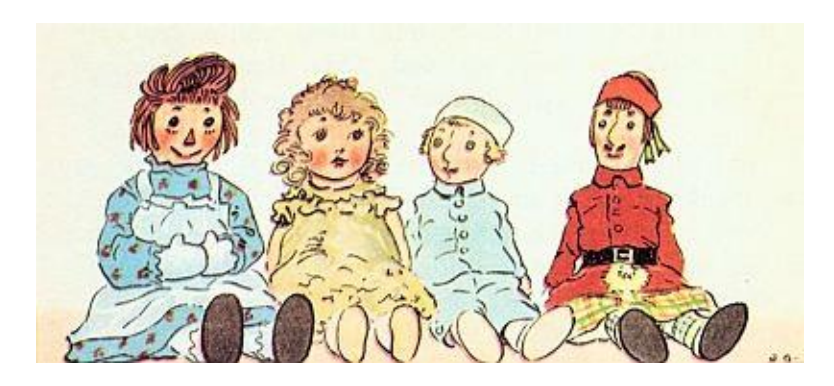
THE NURSERY DANCE

When Raggedy Andy was first brought to the nursery he was very quiet.