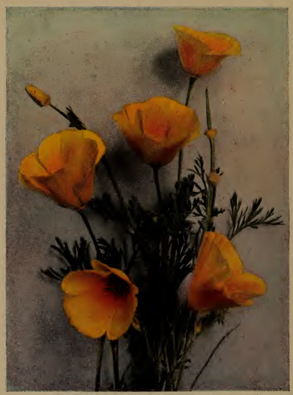
CALIFORNIA POPPY Eschscholtzia californica