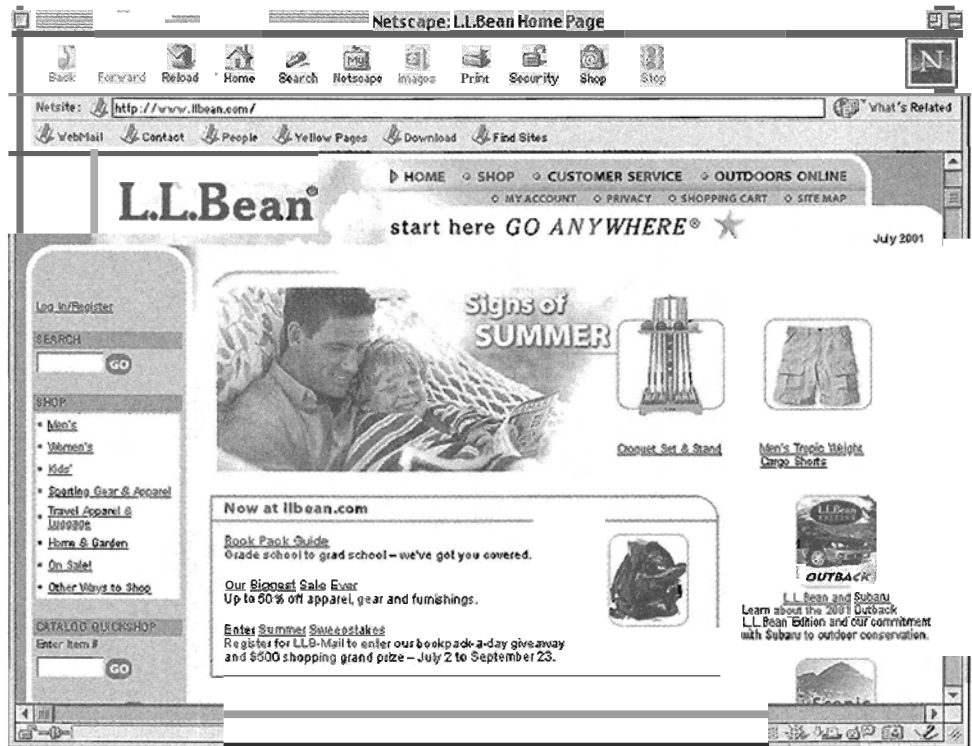
AD 1.1 The website for L.L. Bean represents the newest form of marketing communication,

tises through its direct-mail catalogue and through print ads in prestigious magazines (e.g., National Geographic ). It also has one of the most highly regarded websites (Ad 1.1). Product selection and design are based upon extensive research indicating the preferences of their customers. Since product delivery and possible product return is critical, marketing must be absolutely sure that both these tasks are performed in accordance with customers' wishes (Proposition 5). While one might argue that the marketing function must be the most important function at L.L. Bean, this is not the case. L.L. Bean is just as likely to lose a customer because of incorrect billing (an accounting function) or a flawed hunting boot (a product function) as it is from a misleading ad (a marketing function).