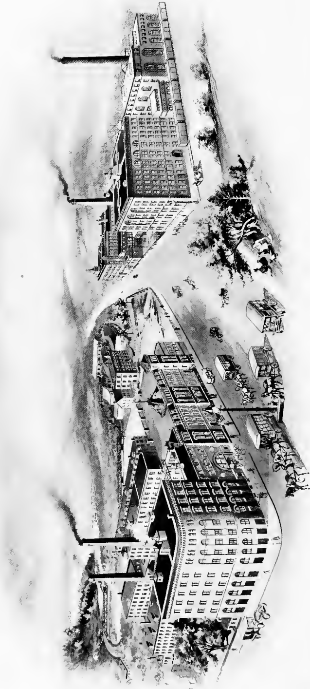
BIRD'S-EYE VIEW OF WALTER BAKER & CO.'S MILLS AT DORCHESTER AND MILTON, MASS.