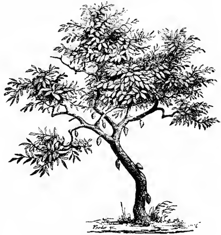
THE COCOA TREE

The seeds of the tree are borne in pods, which are irregular and angular in shape, much like some forms of cucumbers, but more pointed at the lower extremity, and more distinctly grooved. These pods measure in length nine inches to a foot, or even more, and about half as much in diameter. The color, when young, is green, becoming later dark yellow or yellowish brown. The rind is thick and tough. The pods are filled with closely packed "beans," or seeds, embedded in a mass of cellular tissue, sometimes of pleasant subacid taste. The seeds are about as large as ordinary almonds, whitish when fresh, and of a disagreeable bitter taste. When dried they become brown.