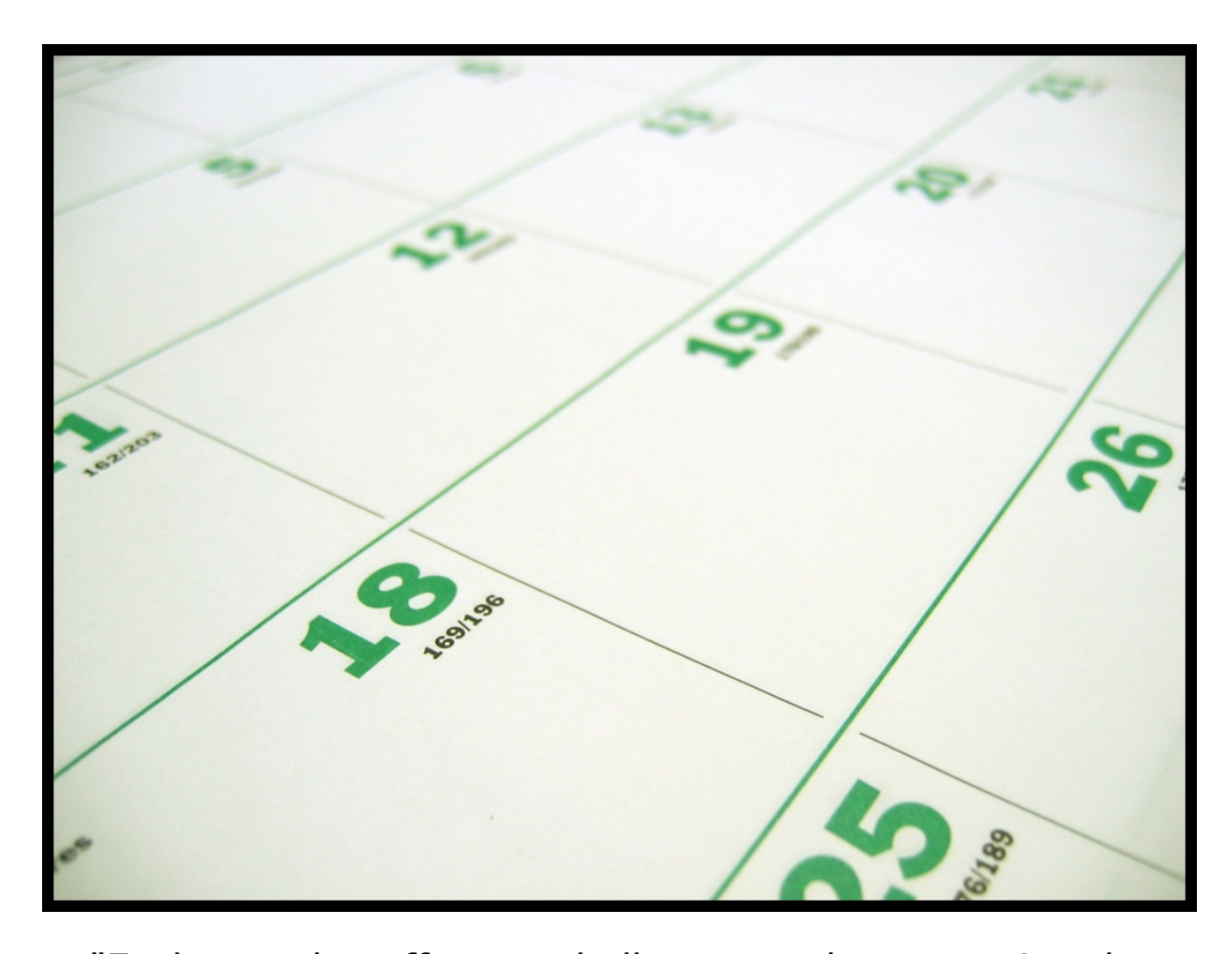
"Each new day offers us challenges and opportunity, the chance for a new beginning. Live each day to the full." - Unknown