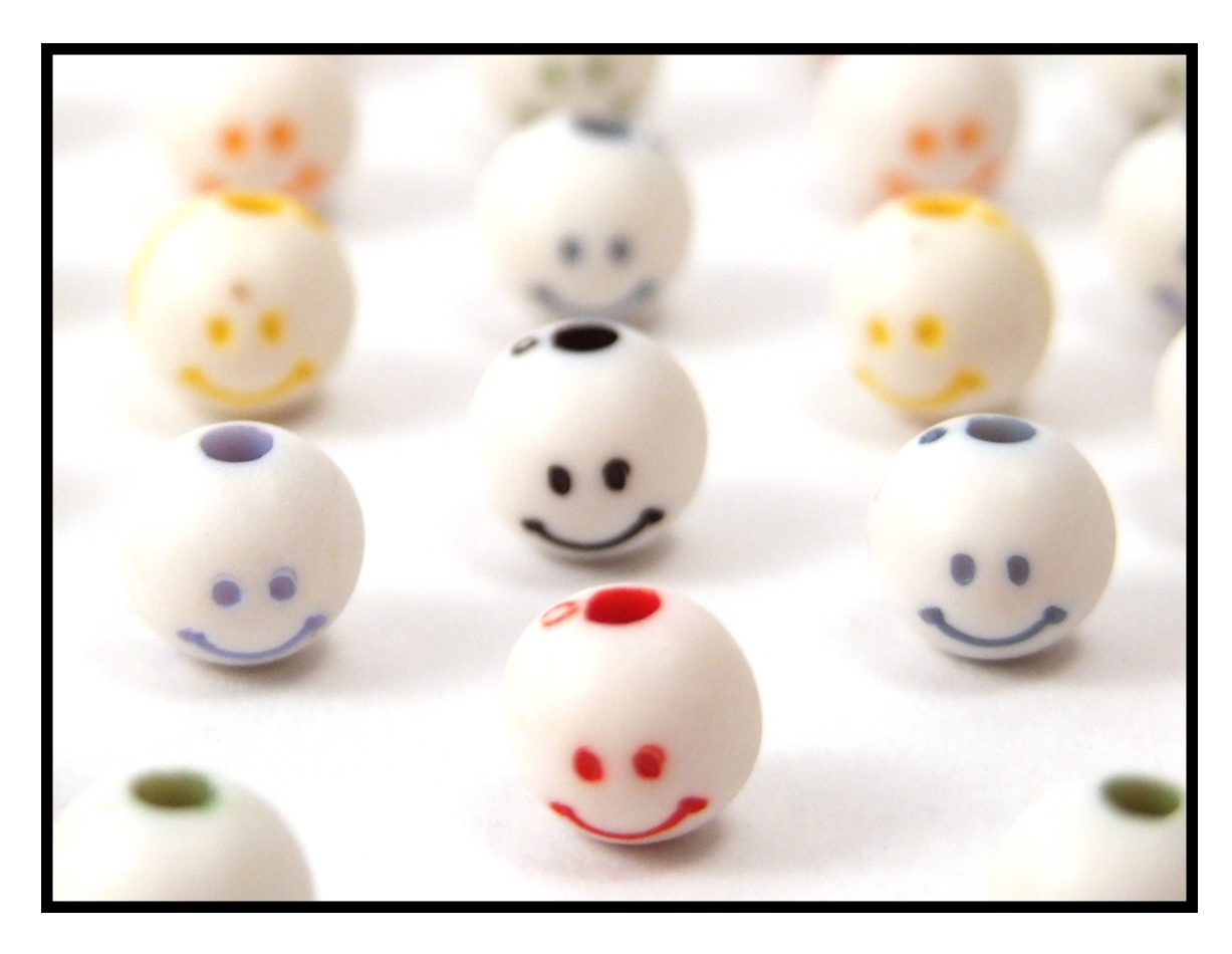
"When life gives you a hundred reasons to cry, show life that you have a thousand reasons to smile." - Unknown