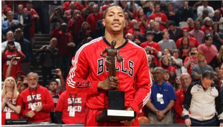
Above: Derrick Rose with the MVP award

Conference Player of the Month: April 2010, March 2011