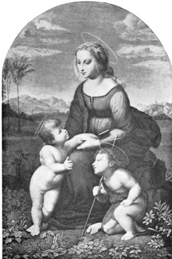
LA BELLE JARDINIÈRE.