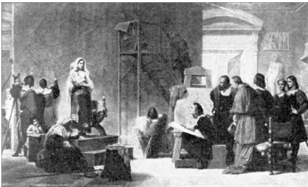
RAPHAEL IN HIS STUDIO.

Raphael did not stay long in Florence at this time, but soon returned to Perugia. His next visit to Florence was of greater length. During these years, 1506 to 1508, he painted many of his best known pictures. In studying the works of Raphael you must never tire of the beautiful Madonna, for it is said that he painted a hundred of these, so much did he love the subject and so successful was he in representing the child Jesus and the lovely mother. Some of his finest Madonnas belong to this time. Let us look at a few of them.