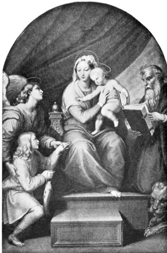
MADONNA OF THE FISH.