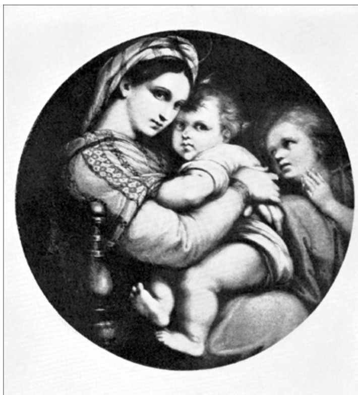
MADONNA DELLA SEDIA.

Now, one winter a great storm arose, and when the hermit saw that his hut was unsafe, his mute friend seemed to beckon him to come up among the branches. Gathering a few crusts, he went up into the tree where, with hundreds of bird companions, his life was saved, though his hut was destroyed. Just as he thought he should die of hunger, Mary, the vine-dresser's daughter, came to see her old friend and took him to her home. Then the pious hermit, Benardo, prayed that his two friends might be glorified together in some way. [37]