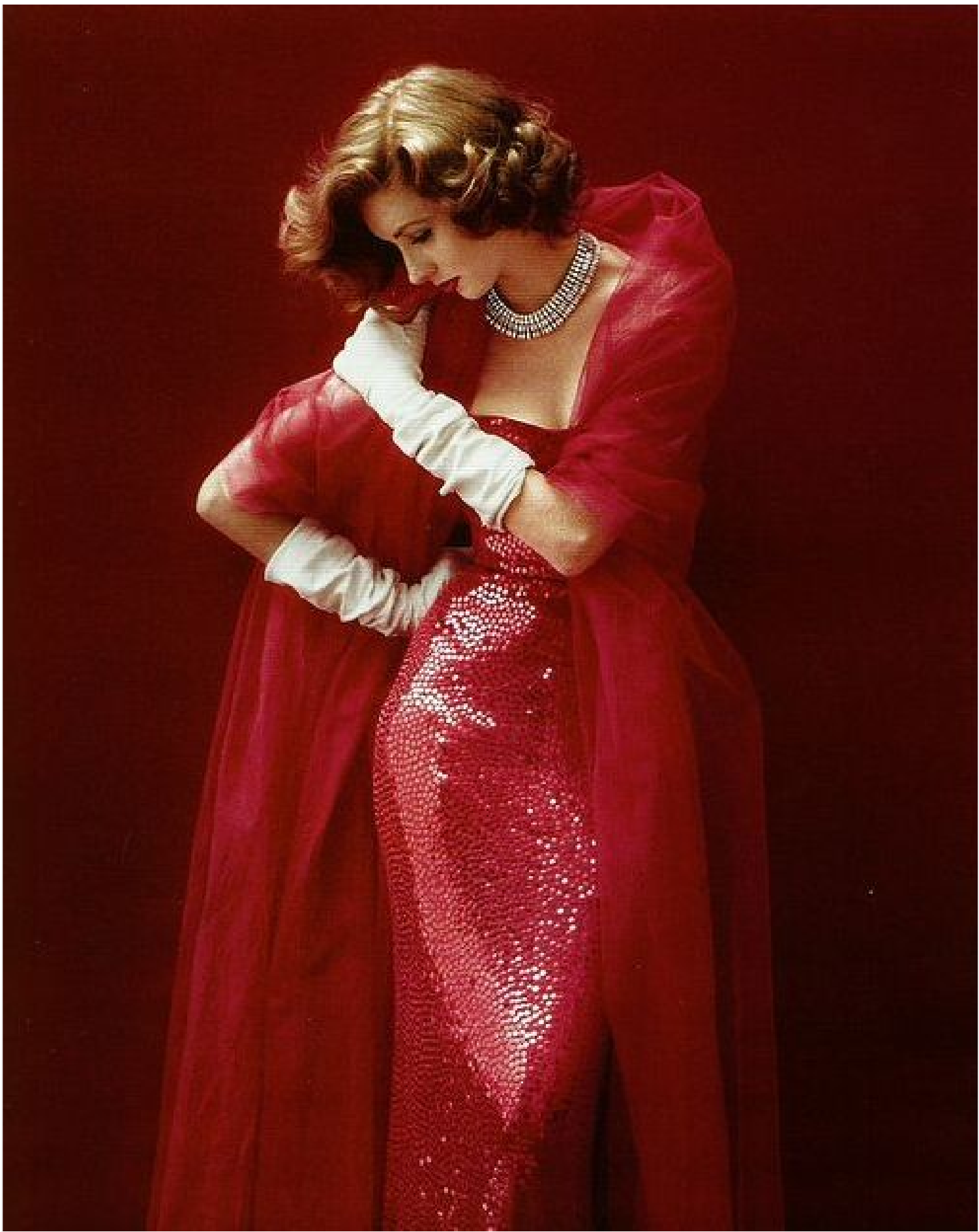
Milton H. Greene