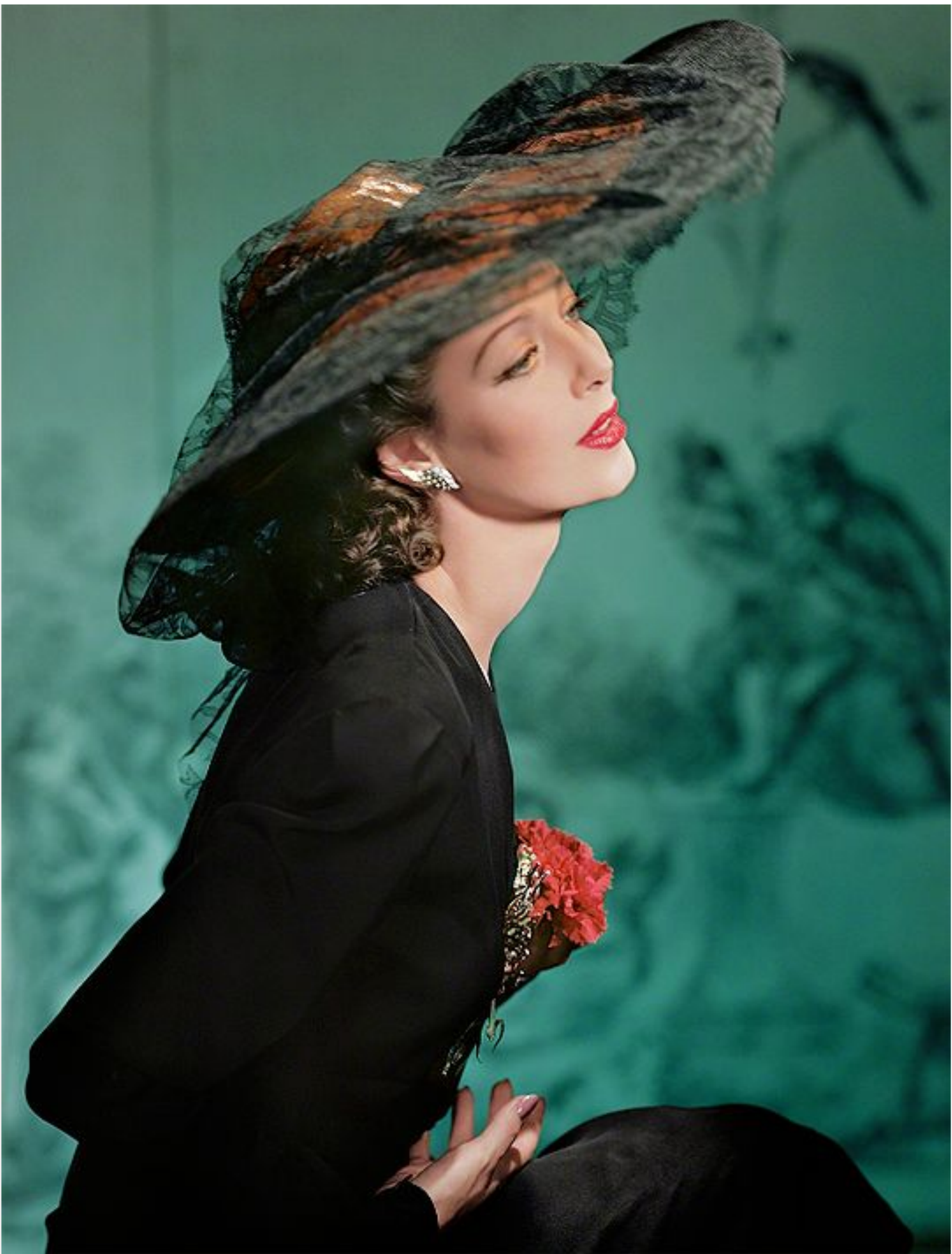
Horst P. Horst