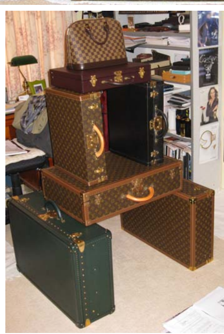
Louis Vuitton as art & Monogram set